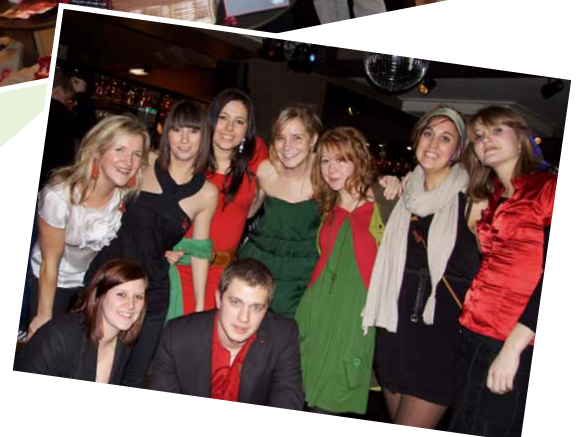
[top and middle] Starbucks' branches across Edinburgh raising money; [bottom] Napier University students fundraising at the Revolution Bar.